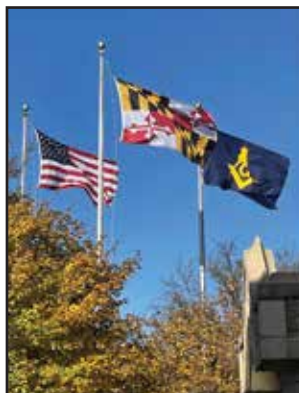
The flag court at the Grand Lodge of Maryland.