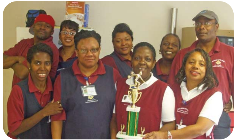
Residents and staff enjoyed National Nursing Home Week with MMH Family Feud, talent show, horse racing, and a competitive Wii bowling tournament. The Environmental Services Department (pictured above) proudly displays the winning trophy.