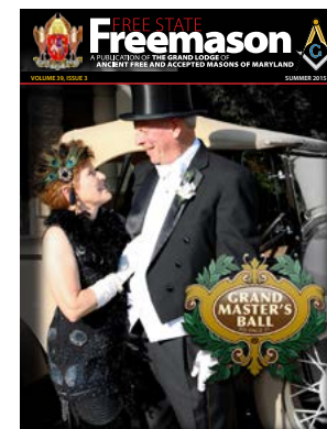
Cover, The Grand Master and Lady Pat arrive in style at the Grand Master's Ball held in June. See photos on page 21.