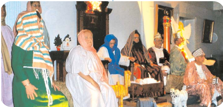
Our Masonic Family Christmas